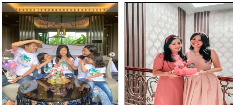
Figure 7 Family picture that celebrate their birthday with macaroon and cake from La Maison

Then for the satisfaction of buyers, there are consumer testimonials to share their experiences on Instagram. By posting photos and videos on Instagram feeds/reels and then tagging Instagram Lamaison.id. In addition, to maintain a good image with consumers, La Maison always comments and likes on consumers' Instagram posts.