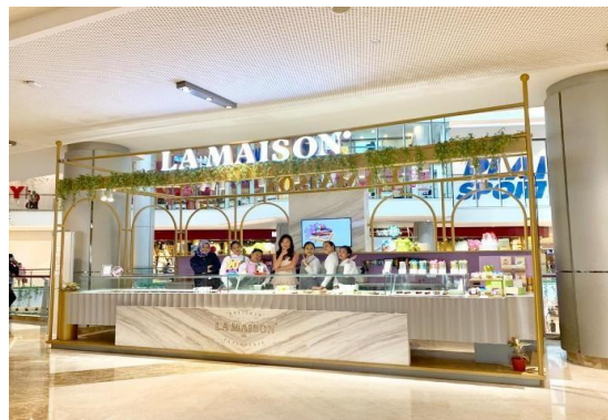
Figure 5 La Maison Store

People that are interested with La Maison's product will search for information about the La Maison store location. The Information can be found through their instagram account @lamaison.id and website Lamaison.id. They have 5 stores, 2 in Medan on Biduk street and Sun Plaza, and 3 stores in Jakarta which are in Grand Indonesia, PIK Avenue Mall, and Plaza Senayan. For more information about the price list and other things can be found in La Maison's instagram bio.