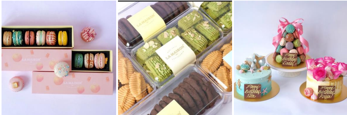
Figure 6 La Maison Products