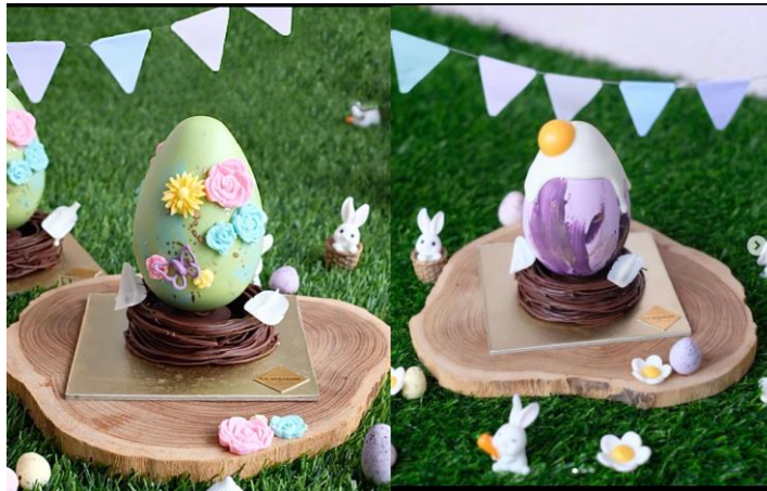
Figure 4 Easter Edition's Product