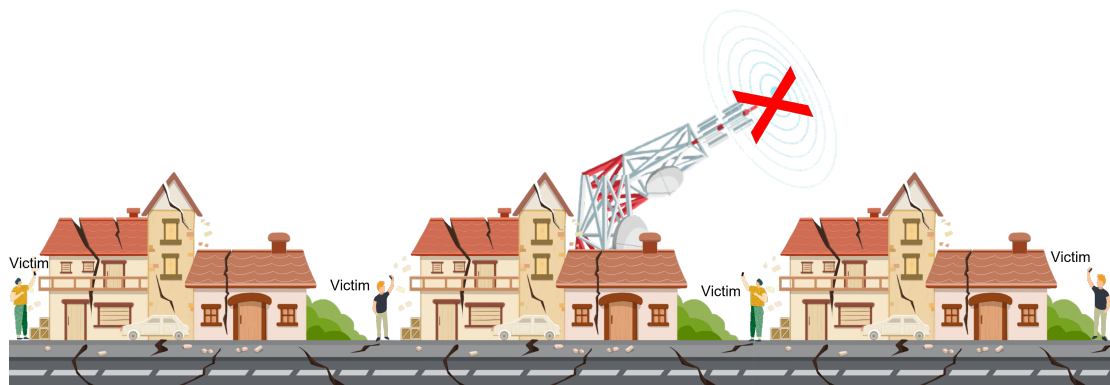
Fig. 1.2 The illustration of the affected area after a natural disaster.

Disasters often strike suddenly and without warning, causing widespread casualties and severe damage to infrastructure. These catastrophic events can be natural, like earthquakes, tsunamis, and floods, or they can be human-caused, through terrorism, industrial accidents, or acts of war. In disaster relief scenarios, communication networks frequently break down during disasters, hampering rescue and recovery efforts. This lack of crucial communication is a common thread connecting all types of disasters, whether they are environmental, technological, or societal in origin. When disasters disrupt normal chan-