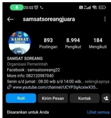
Picture 1. 1 Social Media Instagram Samsat Soreang