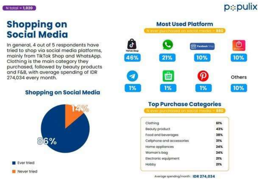
Figure 1.5 Social media shopping survey (social commerce)