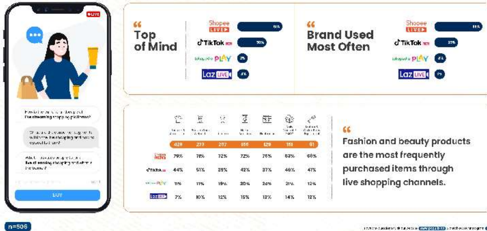
Figure 1.6 Increasing internet penetration is driving the rapid growth of e-commerce in Indonesia