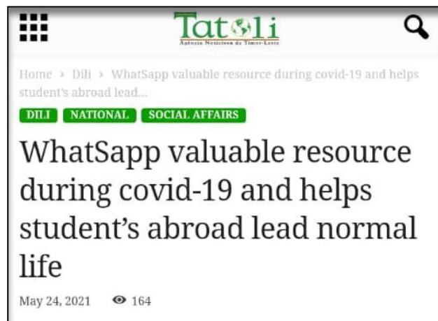
Figure 1.2 WhatsApp valuable resource during covid-19

On the other hand, in the news Tatoli also stated that, a new study carried out by BGU's Communication Department found that for most people and parents specifically who live in an area characterized by ongoing violent conflict, being part of a communal WhatsApp group serves an important role in providing emotional support and sense of security.