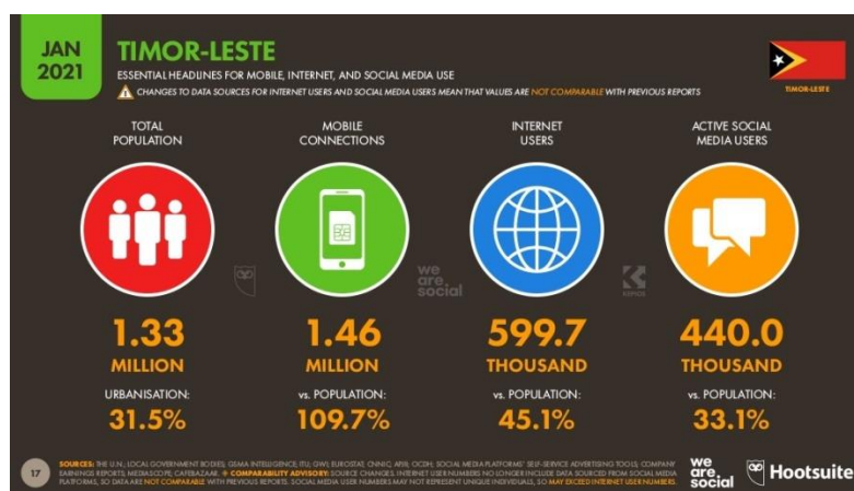
Figure 1.3 Digital Technology Users in Timor Leste, Jan 2021 Source: https://digitalreport.wearesocial.com

The following is data on digital technology users in Timor Leste;