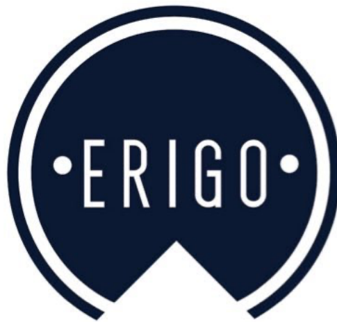
Figure 1.1 Logo Erigo