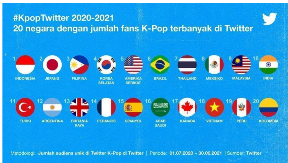
Picture 1.4 Countries That Have Fans Of The K-Pop Wave

The term Hallyu or Korean wave was born in the ears of the public along with the abundance of entertainment from South Korea. The Korean wave is the name of the various cultures of the ginseng country. The Korean wave introduces South Korean culture through various intermediaries, including music, drama, film, culinary, fashion, and so on. However, there is one term that most people are familiar with, namely the music genre, that is K-pop or Korean pop.