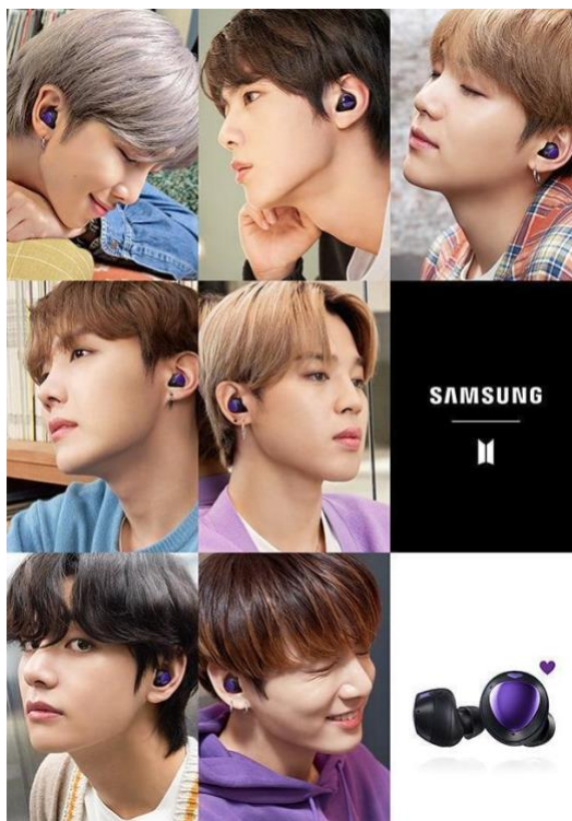
Picture 1.7 Samsung x BTS advertisement