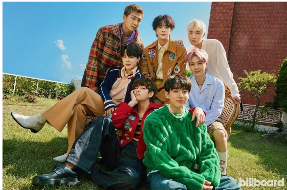
Picture 1.6 Boygroup BTS