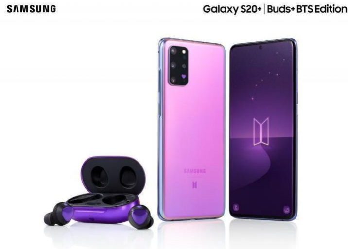
Picture 1.8 Samsung x BTS Ads