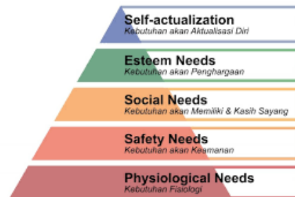
Figure 1 Hierarchy Needs

According to Abraham Maslow, basic human needs consist of five levels: physiological needs, security needs, love needs, esteem needs, and self-actualization. These five levels are called Maslow's Hierarchy of Needs, which is the motivational theory of Abraham Maslow. [4]