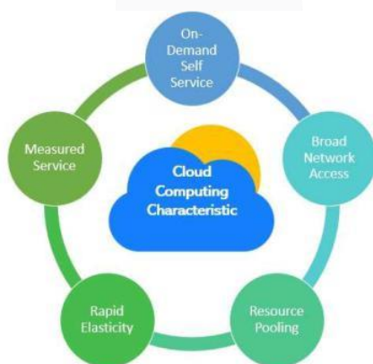
Figure 1. Cloud Computing Characteristics

Based to figure 1 above, there are 5 cloud computing characteristics that indicate a system is categorized as cloud computing according to NIST. The analysis of system characteristics made in this study can be seen as follows [7], [8]: