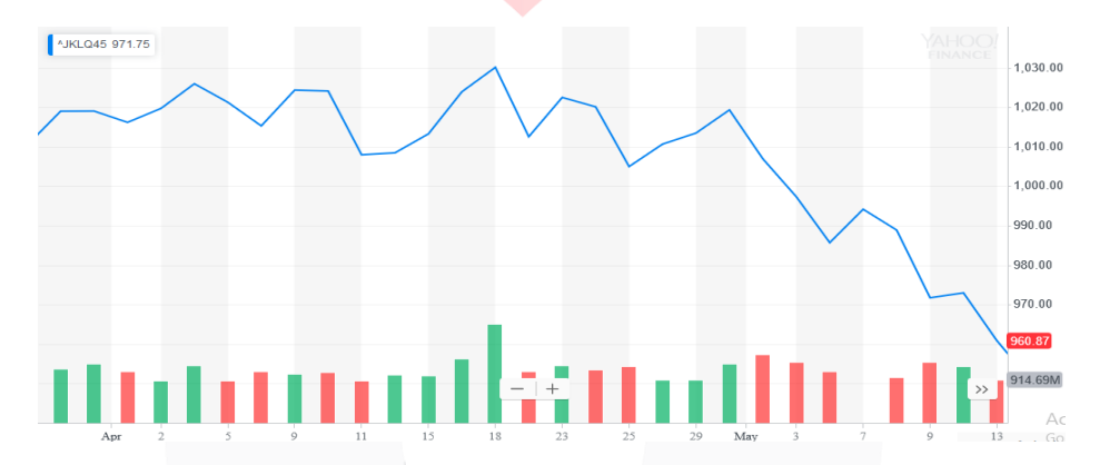
Figure 1.1 Index Share Price Graph

LQ-45 index also shows bullish movement on April 18th, which is the day when all the quick count institution has finished more than 80 percent of the quick count progress. The price opens in the morning on 1,045.21 and closes 1,030.12. The index reaches the highest price on 1,059.65, and also reach the highest of trading volume activity in that week, which states in Figure 1.1 below: