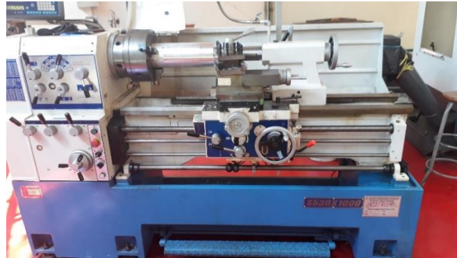
Figure I.2 S530 X 1000 Lathe in Manufacturing Building at Telkom University

In Figure I.2, it is shown a manual turning lathe in the Telkom University manufacturing building