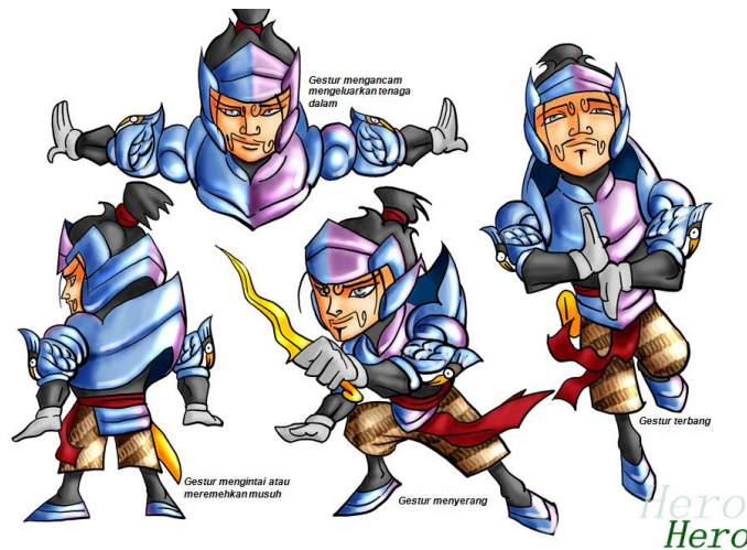
Figure. 2. Development of Figures Krishna

What is mentioned above is actually not new. In the early days of independence of the Republic of Indonesia, for example, has emerged kind of Wayang Pancasila. The contents of the message delivered at the puppet show are the stories of struggle for independence. The Catholic Church has also been developing Wayang Wahyu, whereas in the field of education there are Wayang Kancil (Paeni: 2009). As a medium, the art of puppet show has its own technique and style,