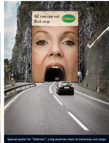
Figure 7. Commercial Photography, Commercial Photography in ads

In ancient times light was considered as surge, but after Albert Einstein discovered that light was a particle through photo electric experiment. With the invention of the electric photo, then comes a new technology, the uses of technology become more advanced, producing a variety of new possibilities, as in the case, the death of photography and is replaced by new, and more sophisticated findings in expressing an image visual is very probable.