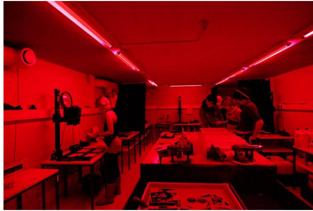
Figure 2. Dark Room for Photography

( http://rlxphotography.files.wordpress.com/2012/03/in_darkroom_4-2-2010- photo_by_hannu_sinisalo- www-600.jpg )