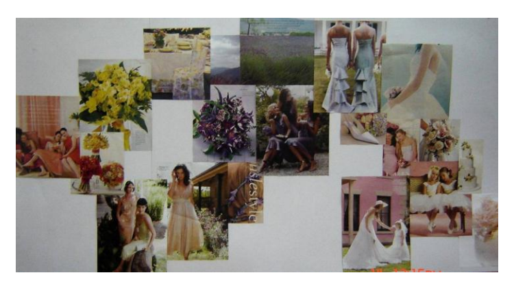
Figure 2. Image Board

After perform Early explorations and knows the fabric character and motif, to simplify and focus on the experiment, at first, the author makes image board. Image board with bright floral theme is chosen to adjust main raw material, batik Pekalongan that has bright colors and floral theme.