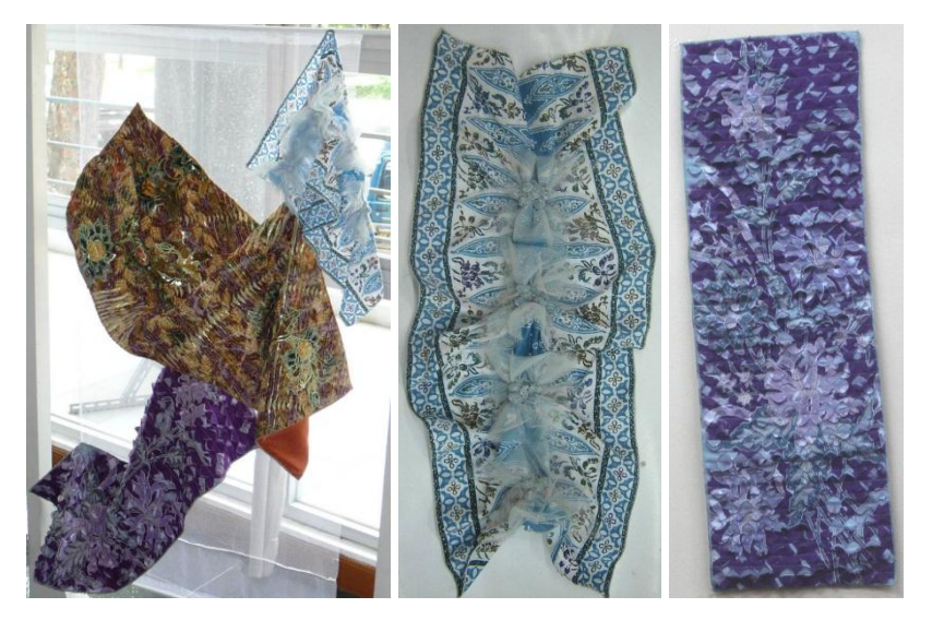
Figure 3. Final Fabric

After exploration finish, exploration results are applied in form of fabric sheets bigger than in experiment size that is 75cm x 150cm. There are three fabric sheets are made: