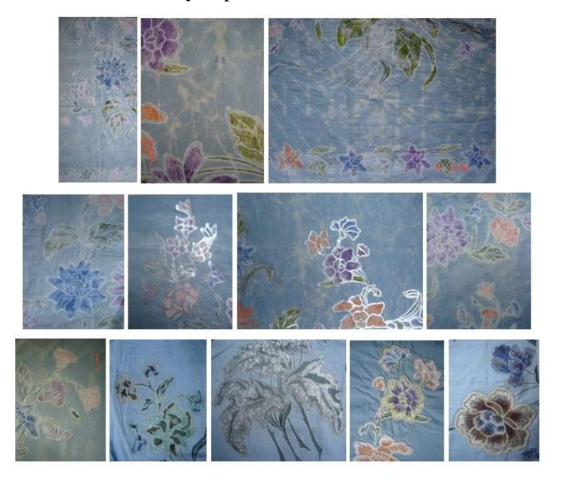
Figure 1. Result of Early Exploration

Below is documentation of Early exploration: