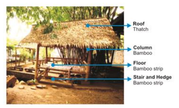
Figure 1. The example of "Saung" or Sunda Hut (2012)