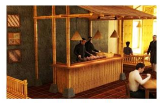
attractiveness Serabi Display Kitchen(2012)