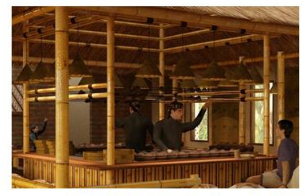
Figure 9.Surabi High attractiveness Traditional Display kitchen (2012)