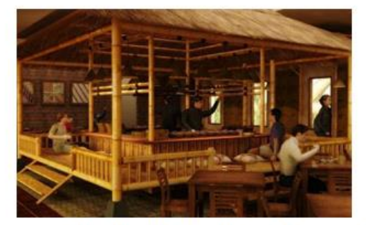
Figure 5.Stimulus III: Traditional concept-low Figure 6.Stimulus IV: Traditional concept-high attractiveness Serabi Display Kitchen(2012)