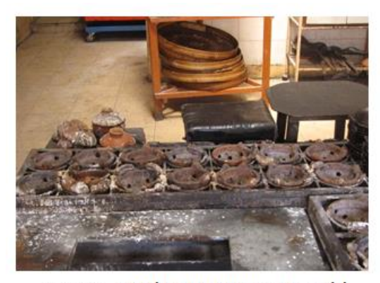
Figure 8.Solo Notosuman Surabi (2012)