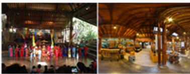
Fig.6. Saung Udjo Angklung Performance

The multiple sensory cues are tapped; lighting, furniture, interior furnishings, music, food and aroma, sound, which all contribute and complement each other as if a sensory orchestration. When the sensory experience is maximized, the restaurant atmosphere creates a compelling experience that consumers will want to repeat through repeated visits.