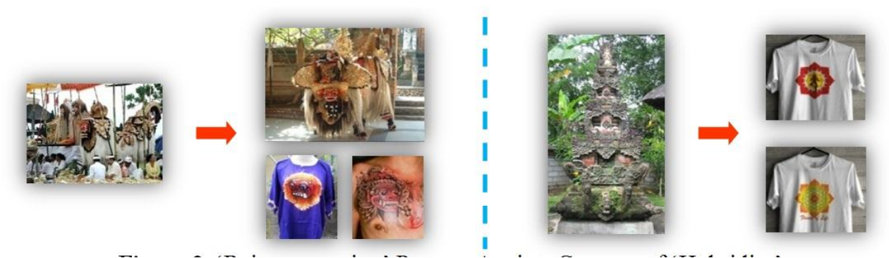
Figure 3. 'Reinterpretation' Process Against Concept of 'Hybridity'