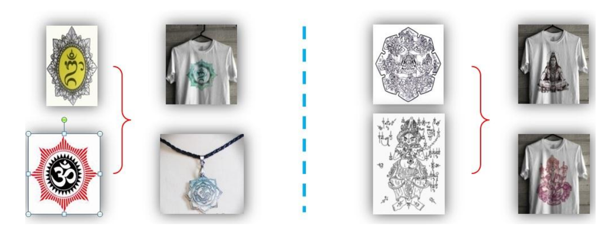
Figure 2. 'Reinterpretation' Process Against Concept of 'Paradox'

Understanding figure 2, can be stated that paradox offers that something is controversial, but it makes a designer feel happy and comfortable to experiment to do 'think more buildless' (thinking a lot about the concept of something that does not have to be built), presenting its nonexistence or negate the presence (the presence of absence or the absence of presence), and build by not having to build it, dismantling and destroying it first (in order to build, you must not build and to construct is to deconstruct). Experimental Concepts (idea) like that is beneficial to enrich the inner and spiritual experience of the designers through exploratory and contemplative approaches without targeting that the object will be realized or not. Based on the history of paradox, it has been developed as a meaning to criticize and to describe a critical point which suggests an alternative way in doing something. It is defined as an ironic levels which contains humor and when the subject becomes worldly, often like seeking God. For designers who make mistakes in understanding and use of paradox as a channel of their creativity, it could lead to a judgment, isolation and ostracism, even humiliation of the public group. Therefore, the fundamental errors must be avoided by a designer.