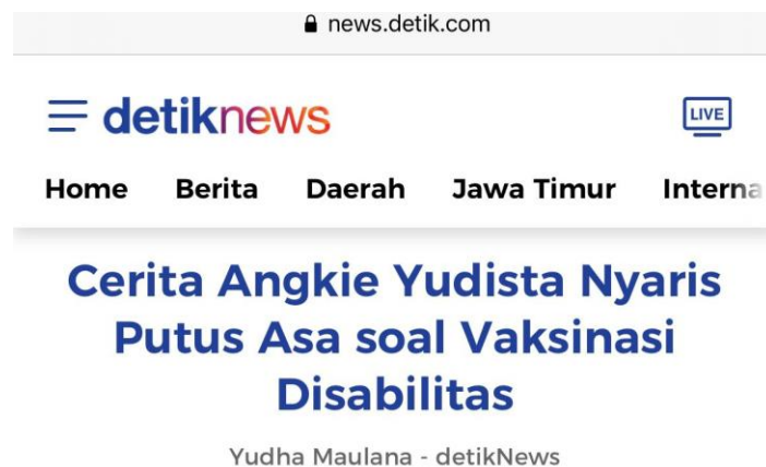
Picture 1. 6 Disability Vaccination Program News on Detik.com