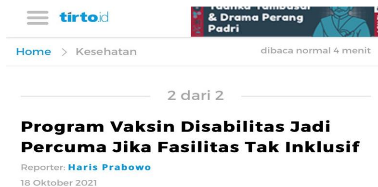
Picture 1. 3 News of The Vaccination Program for Disability in Tirta.id

The vaccination program for persons with disabilities is the author's factor in determining the media to be used in this study. Meanwhile, news about the disability vaccination program was the topic raised because this case experienced many developments, starting from organizers who were not fast enough in the disability vaccination program, the slow trend of Covid-19 vaccination, difficulties for persons with disabilities to join the vaccination program. Of the many factors, the authors conclude that the case is considered interesting to be raised in this study.