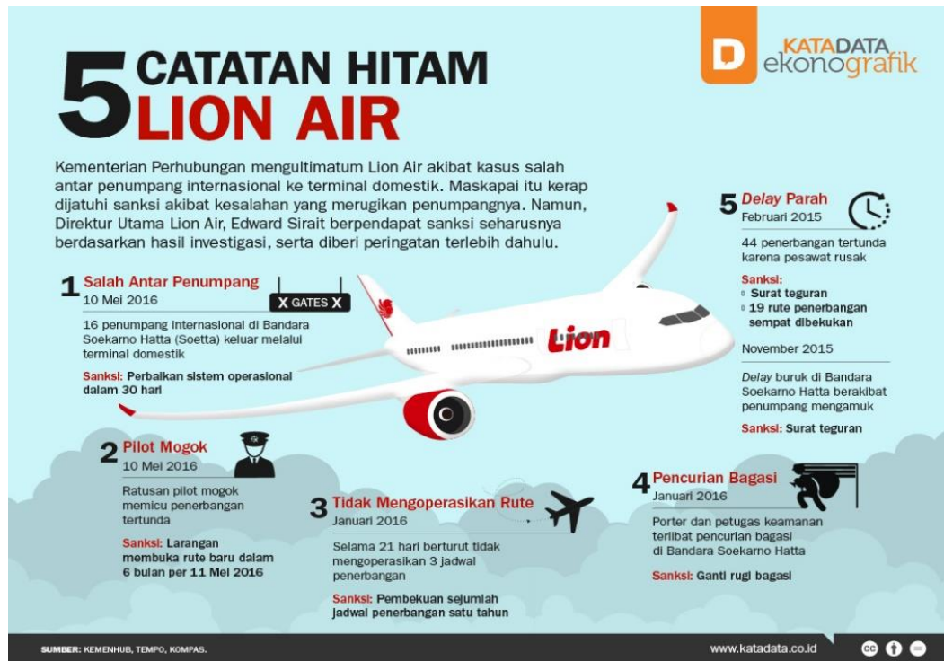
Figure 1. 1 5 catatan hitam Lion Air by katadata

Can be seen above data that Lion Air recorded some bad experiences for its customers. In 2016 Lion Air recorded four unpleasant experiences for its customers. 10 May Lion air routes Singapore - Jakarta. Lion Air landed the aircraft at the domestic terminal I, Lion Air claimed that there was a miss communication with the bus that had been provided by Lion Air. in this case Lion Air received sanctions from the Ministry of Transportation for the negligence (Achmad Dwi Afriyadi, 2016). On the same day, the pilots of the Lion Air airline held a strike. One of the Pilots stated that the Pilot demanded the right to transportation money promised by Lion Air's management (Andri Donnal Putera, 2016). January 2016 Lion Air gets sanctions from the Ministry of Transportation because it does not operate the route for 21 days, penalties obtained by the Ministry of Transportation revoke 3 routes namely Jakarta (Soekarno-Hatta International Airport) - Surabaya (Juanda International Airport), Jakarta (Soekarno-Hatta International Airport) - Medan (Kualanamu International Airport) and Surabaya (Juanda International Airport) – Jaka rta (Soekarno-Hatta International Airport)