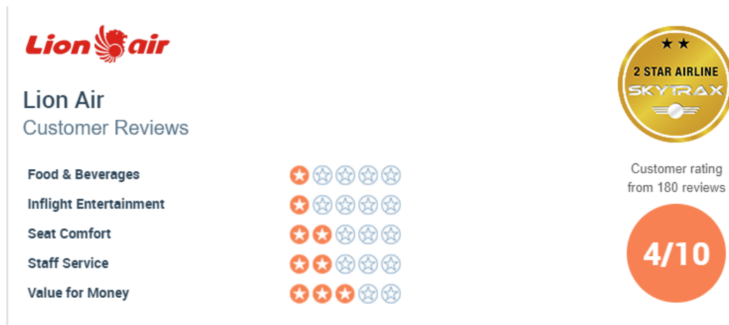
Figure 1. 4 Lion Air Service by skytrax

Stated from (Jake Leavy, 2018) Lion Air is one of the worst airlines in the world. Famous for bridging domestic flights and negligent flight attendants not only ignoring the safety of flight attendant passengers by not checking all cellphone calls, but Lion Air also ranked as the 6th worst in the world. According to Escapehere.com, in the list released by Skytrax 10, the worst ranking airline in the world, Lion Air was ranked 6th. Most airlines only get a maximum rating of 2, or the standard can be said to be very bad. Even though it is cheap, Lion Air is not the best as a community choice. In addition to the cases of Lion Air Pilots and Crew caught using drugs and in 2011 Lion Air became an airline with an 80% delay (Liputan 6, 2016)