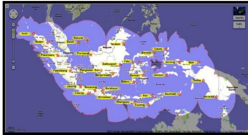
Figure 1. 1 Coverage ADS-B in 30 locations in Indonesia [1]

The advent of the ADS-B spacecraft will usher in an era in which aircraft can be tracked in areas of the ocean that are currently unattended. The CanX-7 nanosatellite will house the RMCC payload which will monitor the aircraft's ADS-B position over the North Atlantic [3]. The demonstration on orbit probe V has proven that space-based surveillance of the 1090ES ADS-B is technically feasible, and thus the objective of the “ADS-B via Satellite” project has been achieved [4]. The space-based ADS-B system providing worldwide coverage will consist of a fleet of satellites equipped with highly advanced multi-channel ADS-B receivers [4]. The world's first PROBA-V satellite with an ADS-B receiver was launched on 7 May 2013, which verified the feasibility of detecting ADS-B signals on board the aircraft. Because of the huge advantages of the space-based ADS-B system, many countries and organizations have invested in research. Dozens of satellites carrying ADS-B receivers have been launched, such as the GOMX series [5, 6] [7, 11] satellites, STU-2 satellites [8], TianTuo-3 [9] and Iridium-NEXT satellites. Among them, Iridium-NEXT has completed 66 satellite deployments and is the first constellation to achieve global aviation surveillance [10], [11]. The first ten Iridium NEXT satellites carrying hosted ADS-B payloads were placed in low Earth orbit (LEO) as part of a 66-satellite constellation projected to provide full Earth coverage for ADS-B signal reception [14].