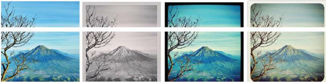
Figure 2. (left-right) questionnaire stimulus: photo of a mountain without filters, modification 1 with Willow, modification 2 with XproII and modification 3 with Earlybird