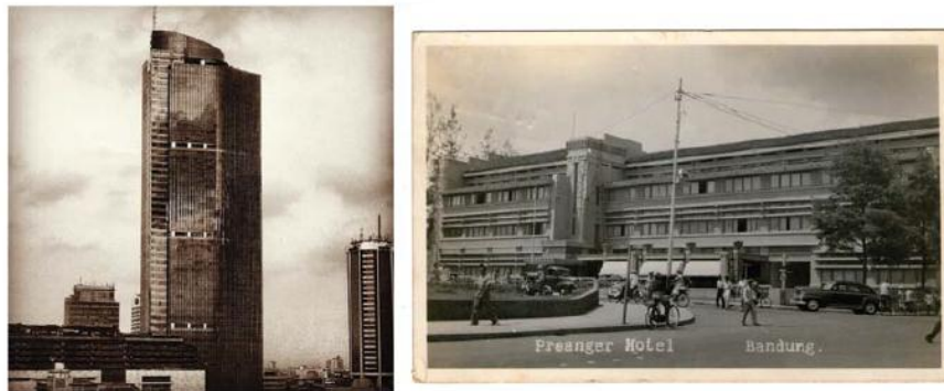
Figure 1 (left-right) the faux vintage photo of modern buildings and the genuine old photo of Preanger Hotel around 1950s.

black and white films, the combination of them produced unique-idiosyncratic photos, yet they had a particular feature that still be recognized as vintage, such as aquatic or yellowish color, black and white, vignette, blur, washed out color, grain, frame etc. Below are the example of black and white vintage photo (right) and the grainy faux one (left) with digital modification in higher level of contrast, additional vignette and the color also has been changed to brownish black and white which brings out the vintage features that familiar to the viewer's eye all harmonized to visualize the experience of old time feeling.